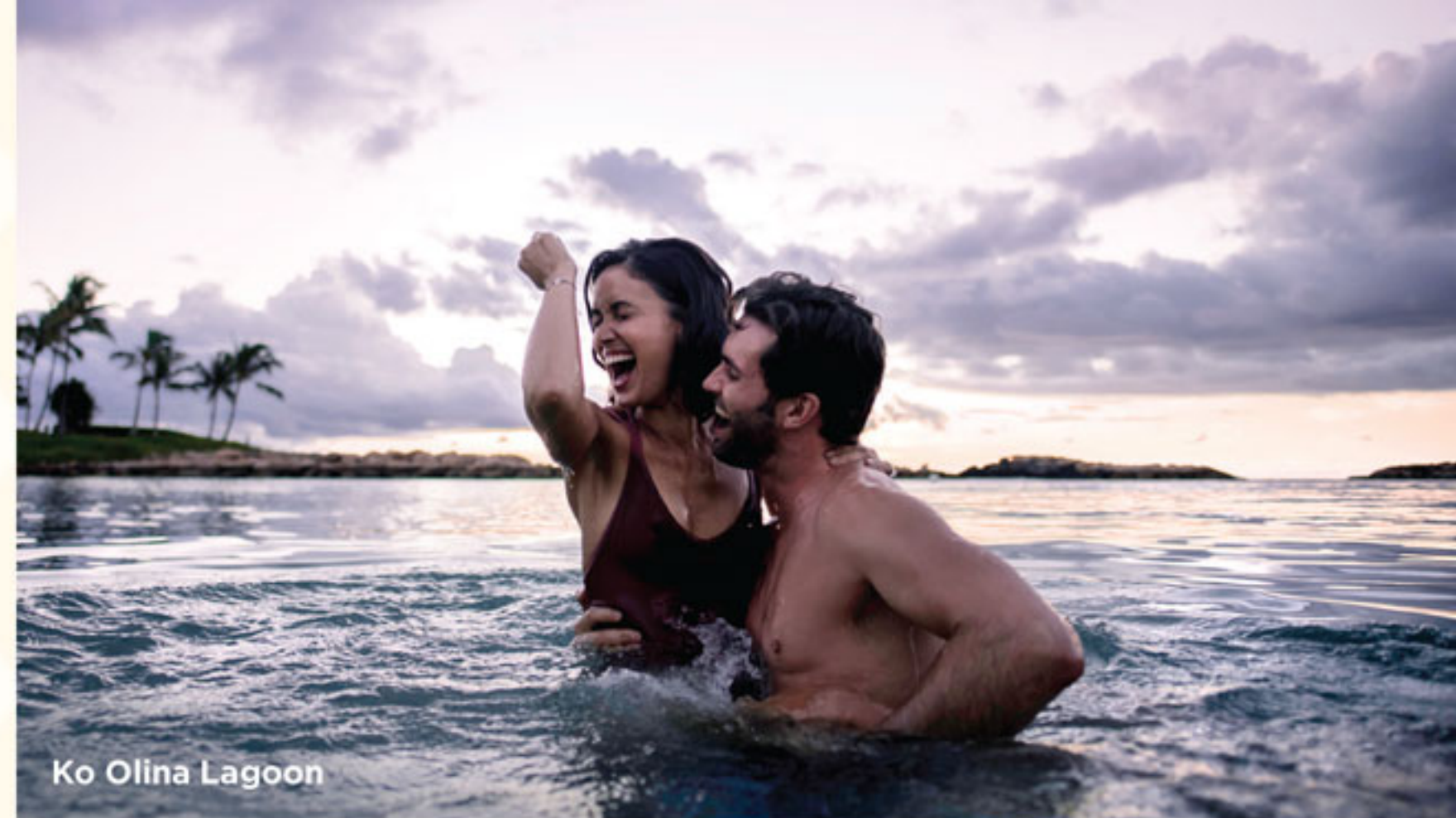
Ko Olina Lagoon