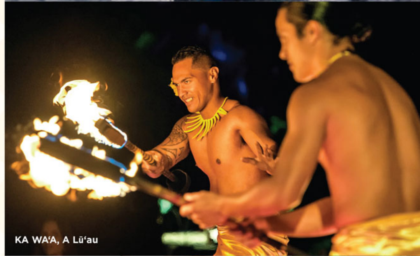
KA WA'A, A Lū'au